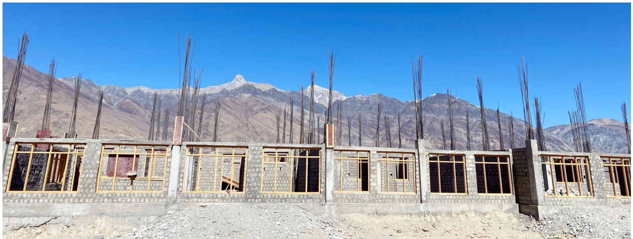
Science Block under Construction