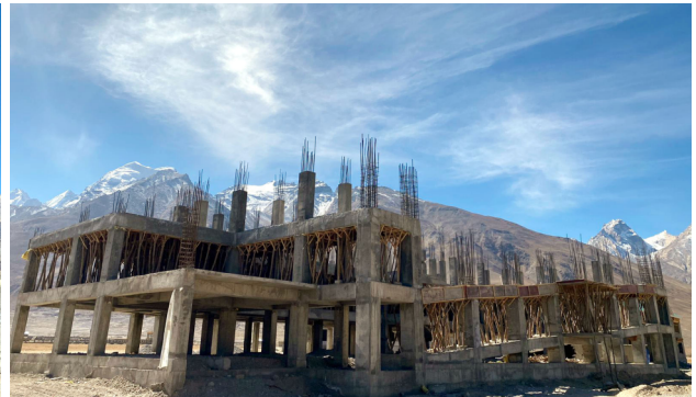
Boys & Girls Hostel under Construction