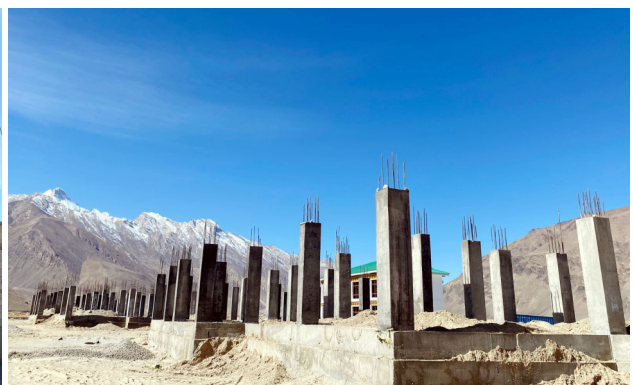
Solar passive Gazetted Staff Quarter under construction.