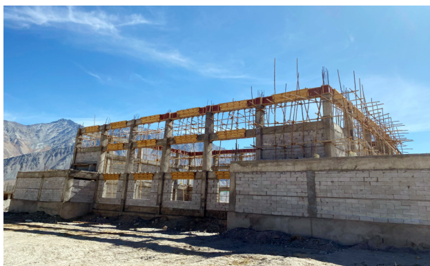
Indoor stadium cum-multipurpose Hall under Construction